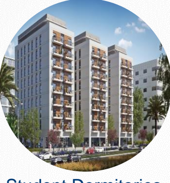
Student Dormitories MIT Holon